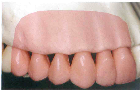
Figure 1. Typical anesthetic range of AMSA injection.