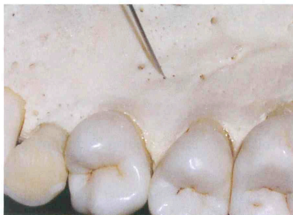
Figure 3. Palatal nutrient canals.